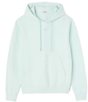
SHPSW00458 H21SANDRO HOODIE 185€ / 124€ €209 / €140