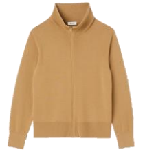
SHPTR00362 E22TRUCKER CARDIGAN 295€ / 198€ €329 / £220