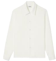
SHPCM00937 H23REQUIN 195€ / 131€ €249 / £146