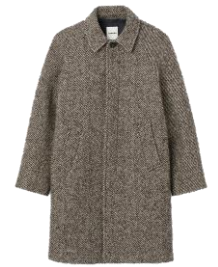
SHPMA00307 H23MAC WOOL TWILL 695€ / 466€ €779 / €521