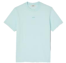
SHPTS00990 H21SANDRO TEE MENTHE 95€ / 64€ €99 / €66