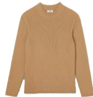
SHPTR00392 H23RIBSTITCH 245€ / 165€ €279 / £186