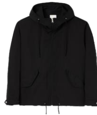
SHPBL00850 H23WINDY 345€ / 232€ €389 / £260