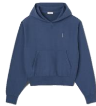
SHPSW00565 H23VERTICAL HOODIE 175€ / 118€ €199 / €133