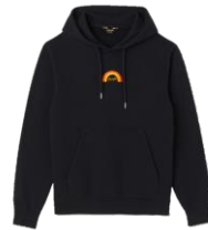
SHPSW00590 H23WRANGLER HOODIE 175€ / 118€ €199 / £133