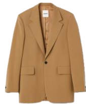
SHPVE00683 H23MODE CAMEL 585€ / 392€ €579 / €387