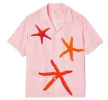
SHPCM00908 H23STARFISH PINK 195€ / 131€ €249 / £146