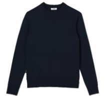
SHPTR00117 H19CREW MERINOS 225€ / 151€ €249 / £166