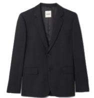
SHPVE00821 H23LEGACY GRIS FONCÉ 475€ / 319€ €469 / €314