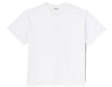
SHPTS01243 E23BOUTIQUE TEE 115€ / 78€ €129 / £86