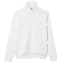
SHPSW00597 H23TRACK JACKET 245€ / 165€ €279 / £186