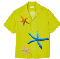
SHPCM00917 H23STARFIH LIME 195€ / 131€ €249 / £146