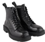
SHACH00613 H23RANGER BOOT 475€ / 319€ €469 / €314