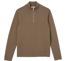
SHPTR00161 H20ZIP SWEATER KAKI 255€ / 171€ €289 / £193